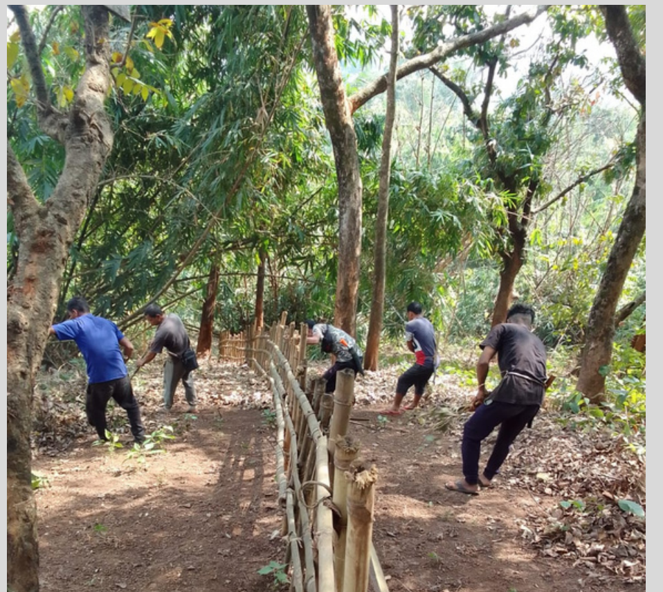
Progressing with the fireline cleaning activities at Ajasiram Community Reserve, under Resubelpara Block .