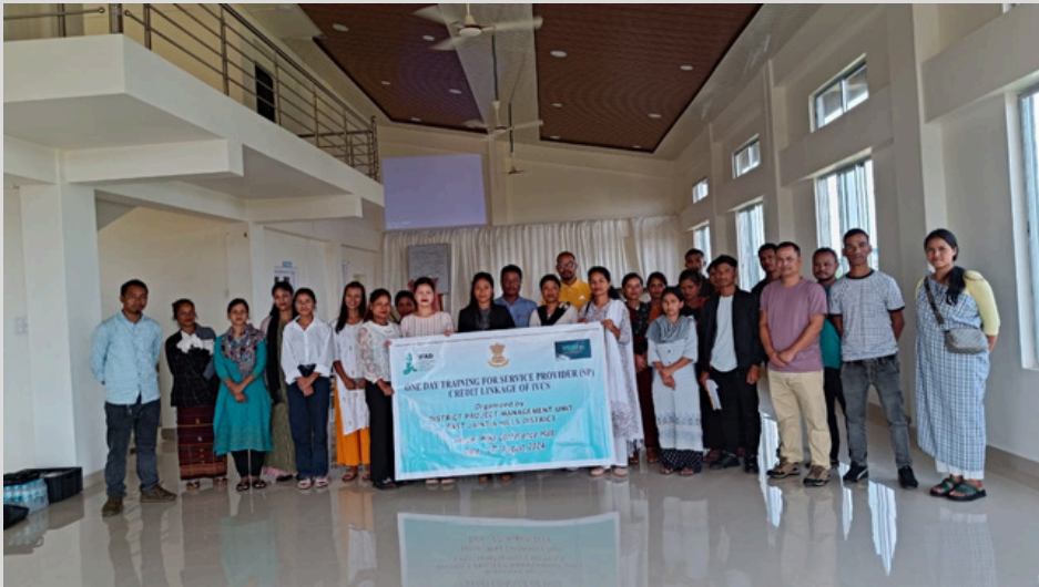
A one-day training session for Service Provider Credit Linkage of IVCS was held on August 27, 2024, at Wika Guest House, Khliehriat, East Jaintia Hills. The training aimed to review progress and provide guidance to Service Providers in achieving credit linkage targets at the IVCS level.