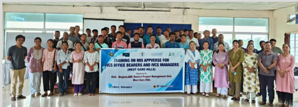
On August 30, 2024, training on the MIS AppVerse application for data collection at the field level was conducted for IVCS in-charges and managers from all IVCS in East Khasi Hills at the District Project Management Unit office. A similar training was held the same day for IVCS office bearers and managers of MLAMP Blocks in West Garo Hills at the SMELC Building, Dakopgre, Tura. The training was later extended to Phase III IVCS office bearers and managers on September 3, 2024. Awareness on the Grievance Redressal Mechanism (GRM) was also provided during both sessions.