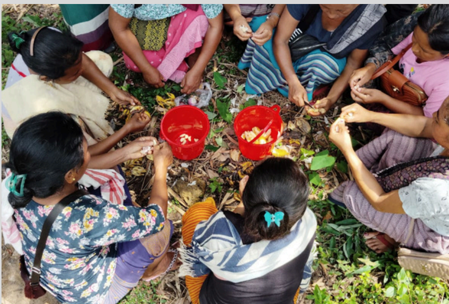
On August 28, 2024, the DPMU South West Khasi Hills District conducted Farmer Field School (FFS) training on livestock for members of Khonjoy IVCS, with a focus on the Bokashi method. The training covered the preparation of Oriental Herbal Nutrient (OHN), Fermented Fruit Juice (FFJ), Lactic Acid Bacteria (LAB), and shed preparation using layers of wood logs, dried leaves, soil, and Indigenous Microorganisms (IMO).