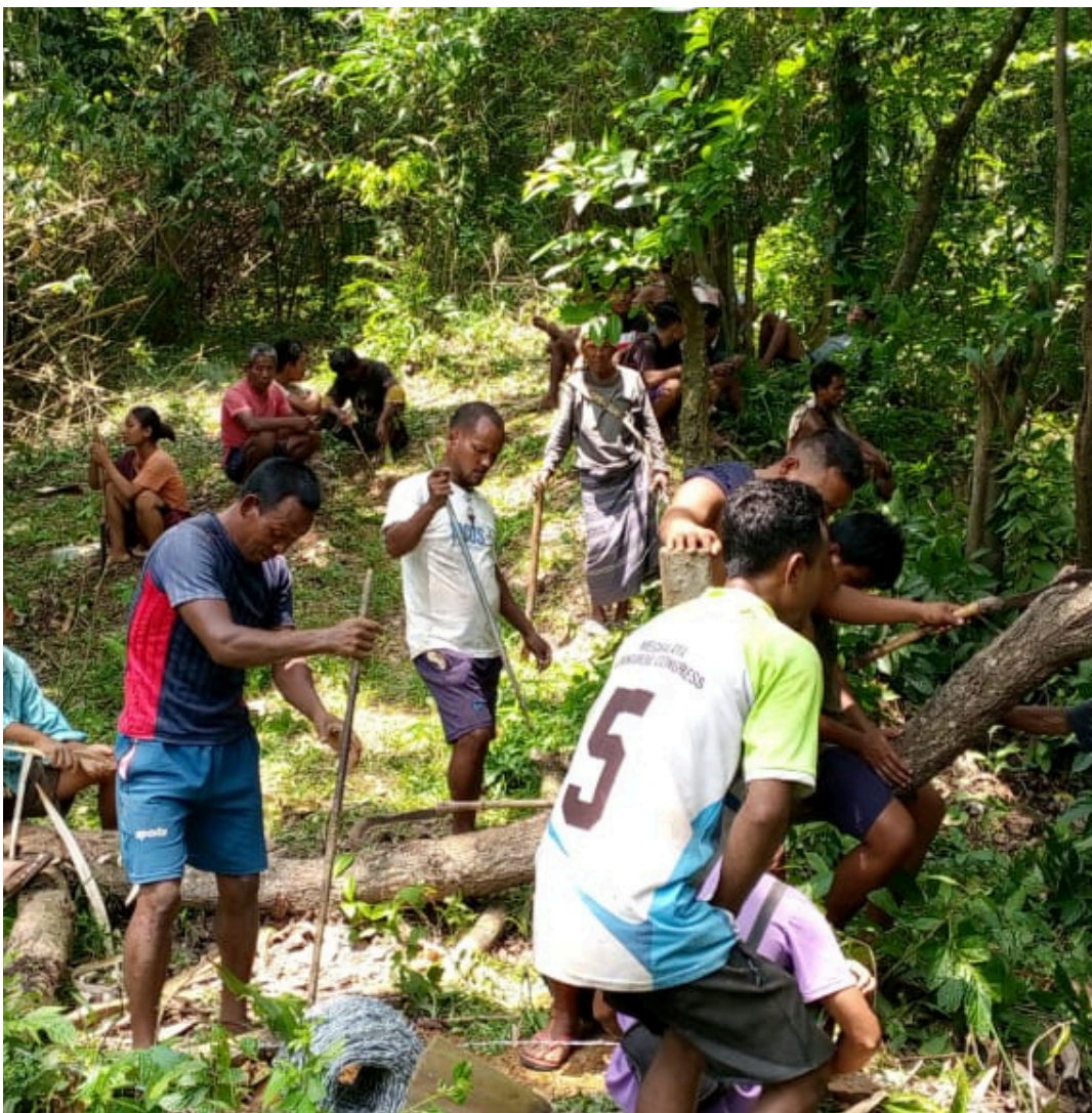
2nd year PES activities carried out by Dubagre community