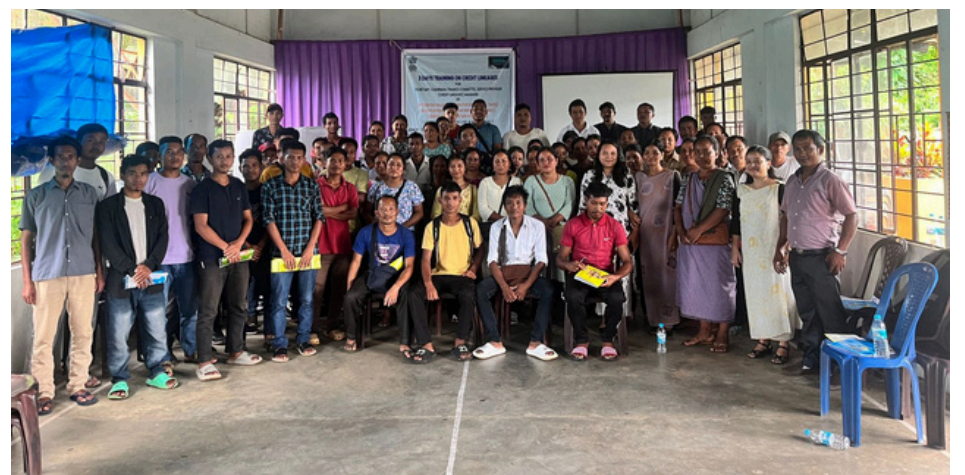
A 3-day training program on Credit Linkage was conducted in two batches for IVCS in Ri Bhoi. The first batch, consisting of 14 new and adopted IVCS, was held at Umdihar Prime Hub from July 8th to 10th, 2024. The second batch, comprising 22 old IVCS, took place at Mawroh Hall, Nongpoh, from July 11th to 13th, 2024.

Key topics covered during the training included: