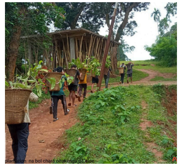
Lifting of saplings in the Rongara block and in the Kerupara village of the Gambegre block.