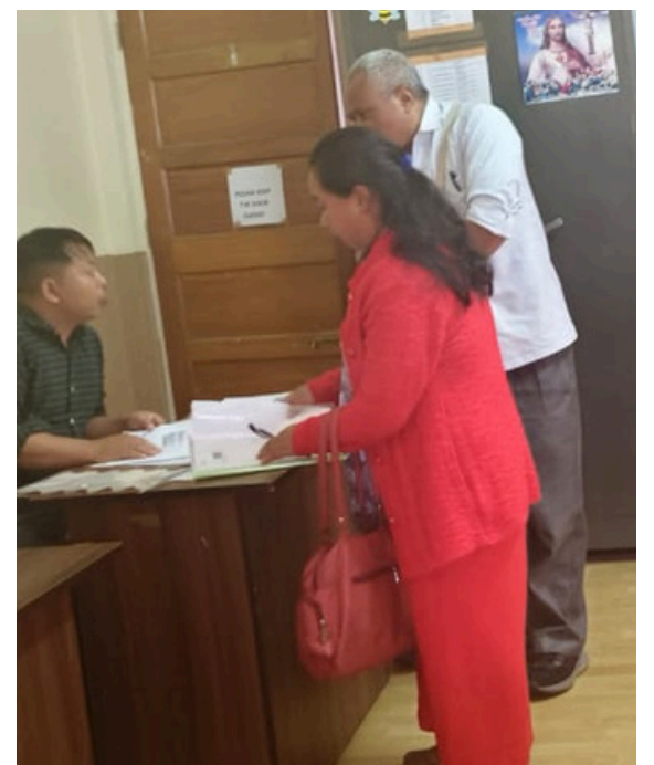
Facilitation of opening of Bank Accounts for Self Help Group (SHG) on the 25th and 26th of June 2024 for Ganol Catchment Villages whereas 2nd and 5th July 2024 for Umiew Catchment Villages respectively .