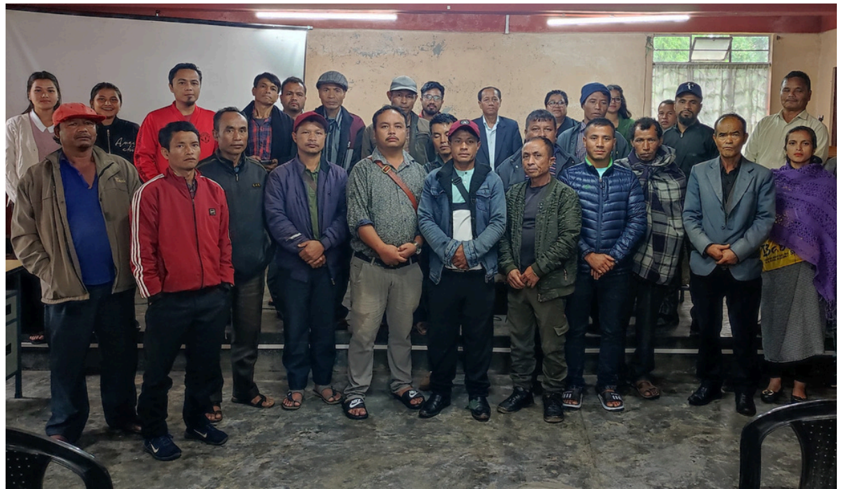
The Block Awareness Program, held on July 4, 2024, at 5th Mile, Upper Shillong under the Myllem Block and 11th July 2024, at Khatarshong Laitkroh Block with an aim to raise awareness about the MegArise Project. This initiative focuses on the protection and sustainable management of the Umiew Catchment and the villages within this region. The program saw the participation of representatives from several villages in the catchment area, key block officials, and teams from CMU.