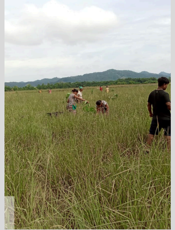
Gap filling for plantations at Kurung VPIC in 2023