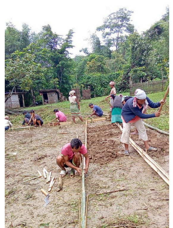
New community nurseries are being established in the villages of Sampalgre and Jawakgre.