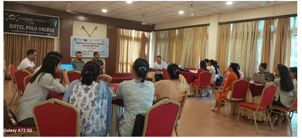
On July 17th, 2024, a regional-level review meeting was held at Hotel Polo Orchid, Tura, for Megha-LAMP staffs in the Garo Hills region. The meeting included RF, SPMU, and District Teams from WGH, SGH, and SWGH.