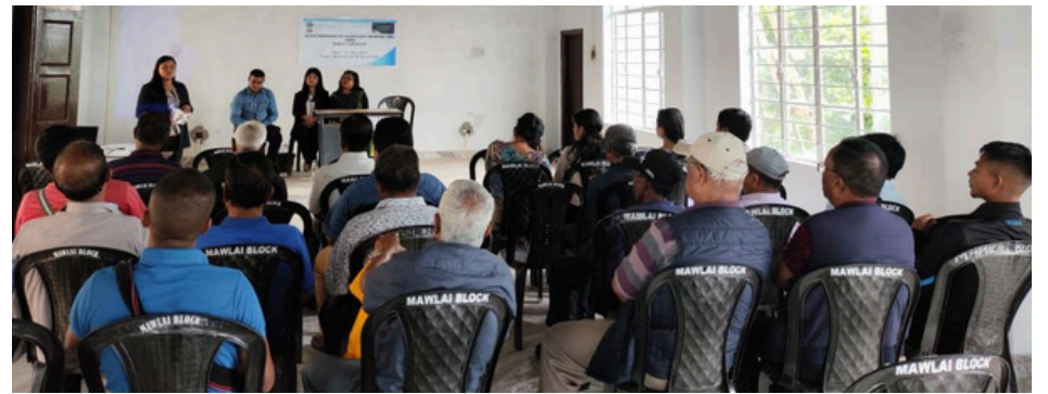
Block awareness session on VDV for the Headman/Secretary of 24 villages under Mawlai C&R&D Block was conducted on July 11, 2024, at Mawlai C&R&D Block Hall. The session was attended by the APO on behalf of the BDO, headmen, and officials from the Block office. The Headman actively participated and provided suggestions for enhancing the smooth functioning of the VDV across different villages.