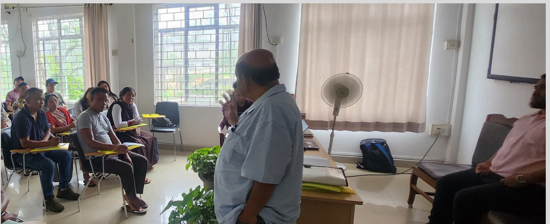
Training on Basics of Book keeping for IGA nodal persons and IVCS members