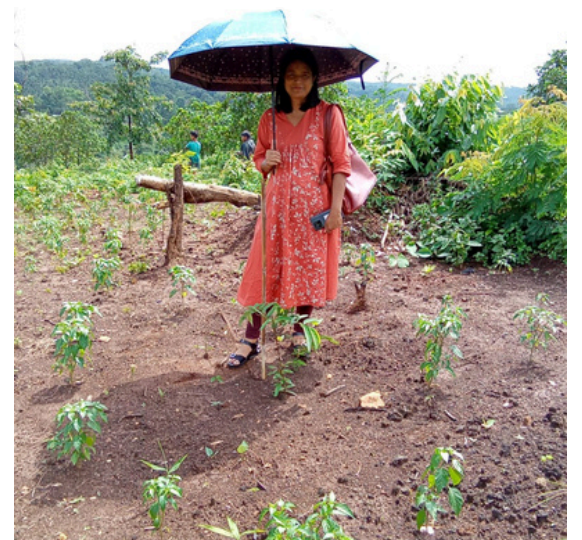
Artocarpus heterophyllus saplings from one-week-old plantation sites in Balupara and Gambaregre