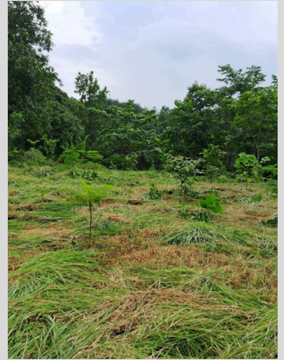
Gap filling in plantation sites at Khaldang Tunaturam Community Reserve and Balikingre Village.