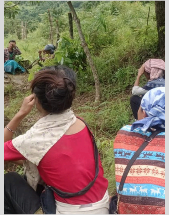
Tree planting efforts are ongoing at the Thapa Dangre Community Reserve. Additionally, plantation activities are continuing at Saipung.