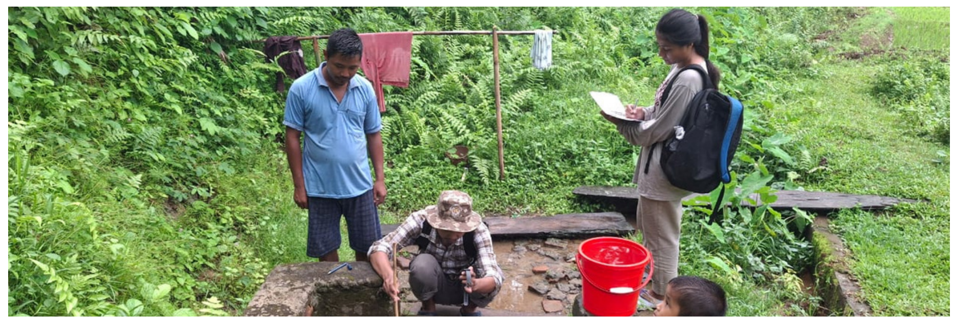
Spring mapping in Betasing Block, South West Garo Hills (SWGH)