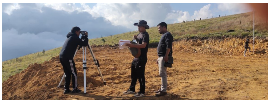
Inspections were conducted on November 22, 2023, for both community nursery land development and land development for the Collective Marketing Centre (Prefab) in Khrang, Khatarshnong Laitkroh Block, East Khasi Hills .