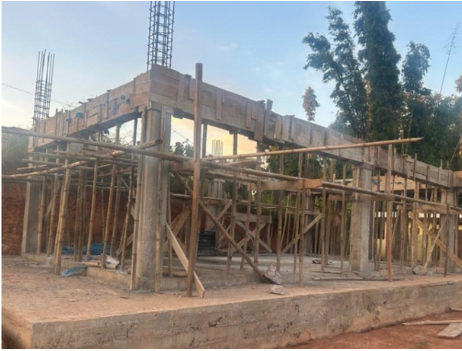
Collaborative assessment and discussion regarding the Community Hall project at Myntriang Madan Ball. Present at the evaluation were the District Project Manager (DPM), Village Education Committee Secretary (VEC), and the Executive Engineer from the KM team.