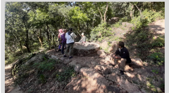
SWKH DPMU conducted a follow-up on the botanical garden, advising members on future actions needed to enhance the garden for the benefit of the village.