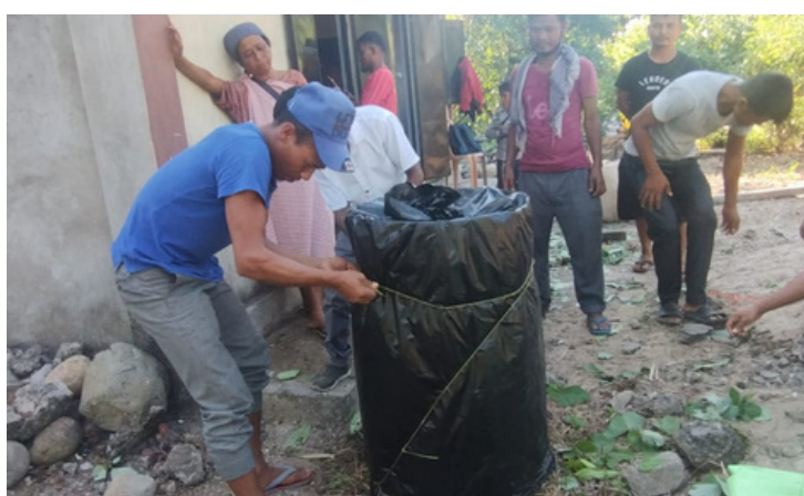
A two-day training on pepper cultivation for Producer Groups (PGs) took place at Umpung village, under Umpung cluster, Ranikor C & RD Block. The program, conducted by the ISC & ED Component, Mawkyrwat, South West Khasi Hills , was held on November 23rd and 24th, 2023.