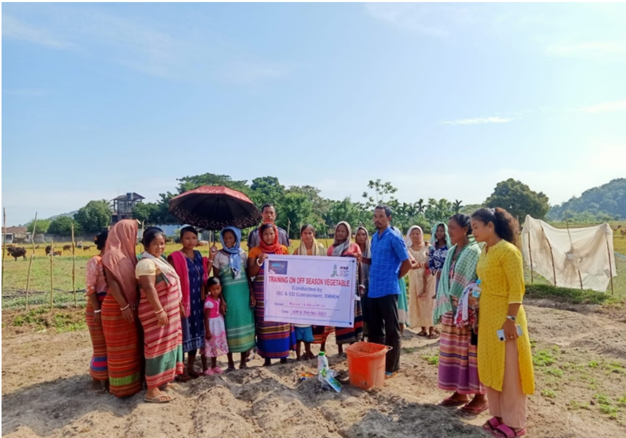
A training session on off-season vegetable cultivation for Producer Groups took place at Munaisora village, Ranikor Block, South West Khasi Hills from November 14th to November 15th, 2023.