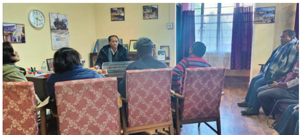
Meeting on Farmer's Market with the Block Development Officer and the Diengkynthong Farmer's Market Committee took place at Khatarshnong Laitkroh Block, East Khasi Hills on November 22, 2023.