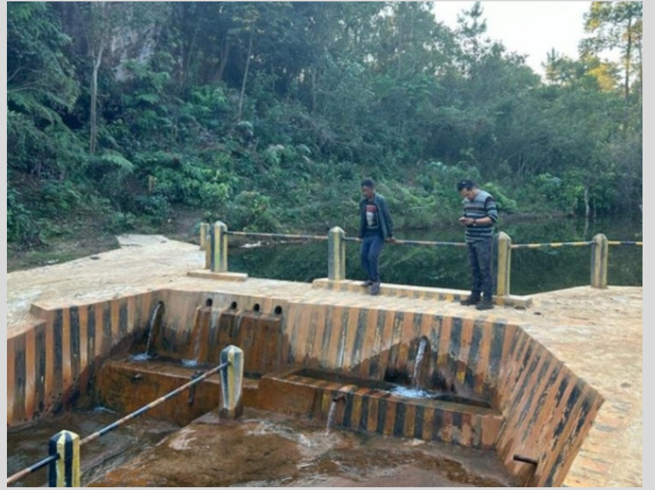
Engaging in a detailed inspection of the Check Dam project initiated under the CTF-SRES activity in Mynjhad at Myntriang village.