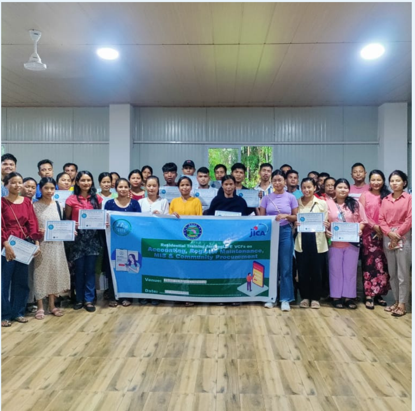
Umsning and Umling C&RD Block (RiBhoi).