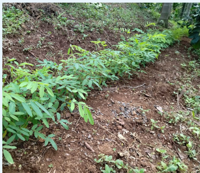
SALT farm at Chandigre village.