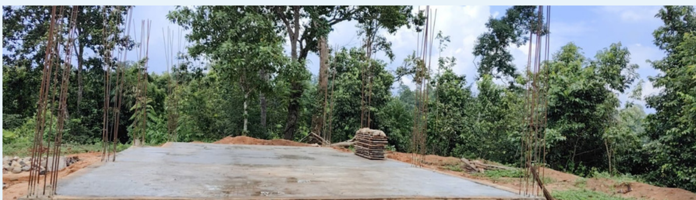
Rongribo Amalgre village.