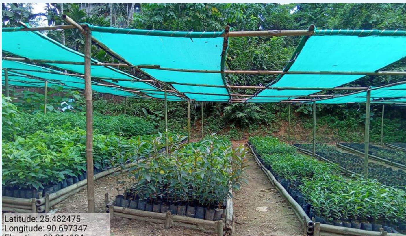
Rongkandi Songgital village.