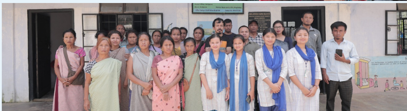
6th September 2023: A visit by various government line departments to the Village Information Centre in Lamin village, Amlarem Block, West Jaintia Hills.