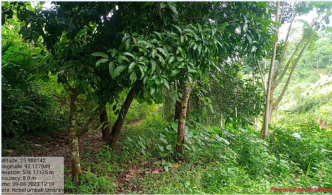
PES verification at Umkhang village.