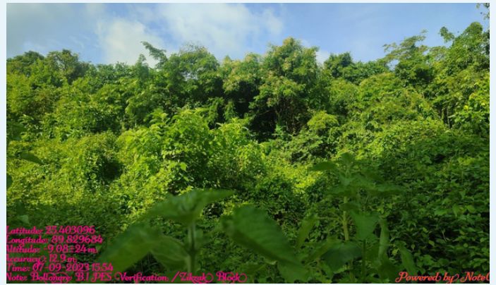
Bollongre village Batch 1: Reserve Forest