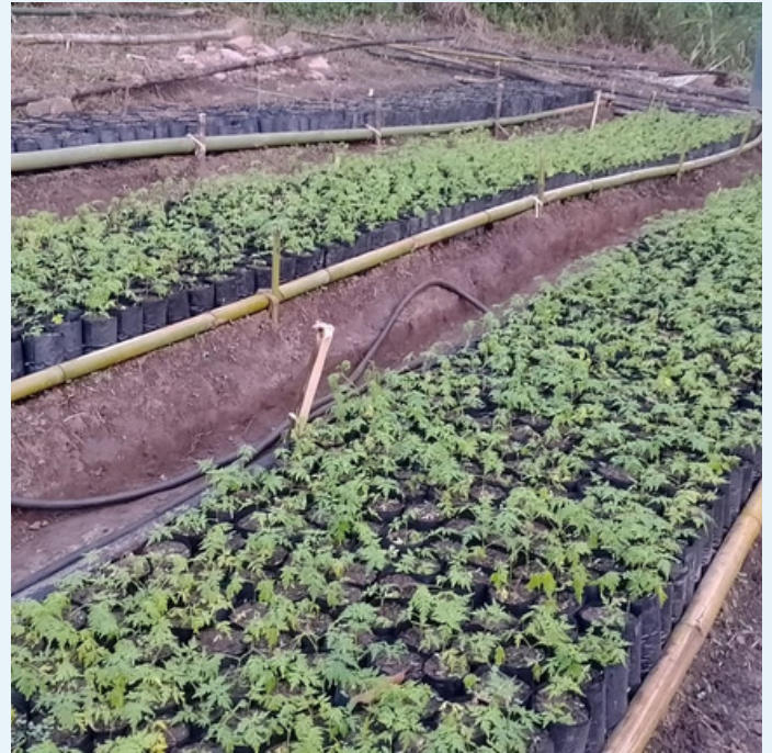
Nursery extension at Daistong village.