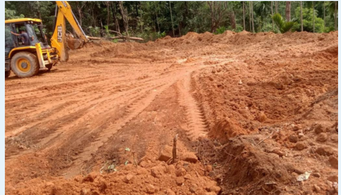
Darang Chiga village.