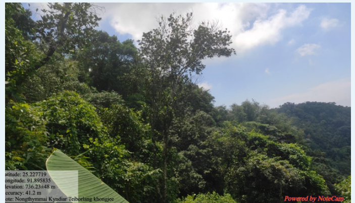
PES verification completed in Nongthymmai Kyndiar village.