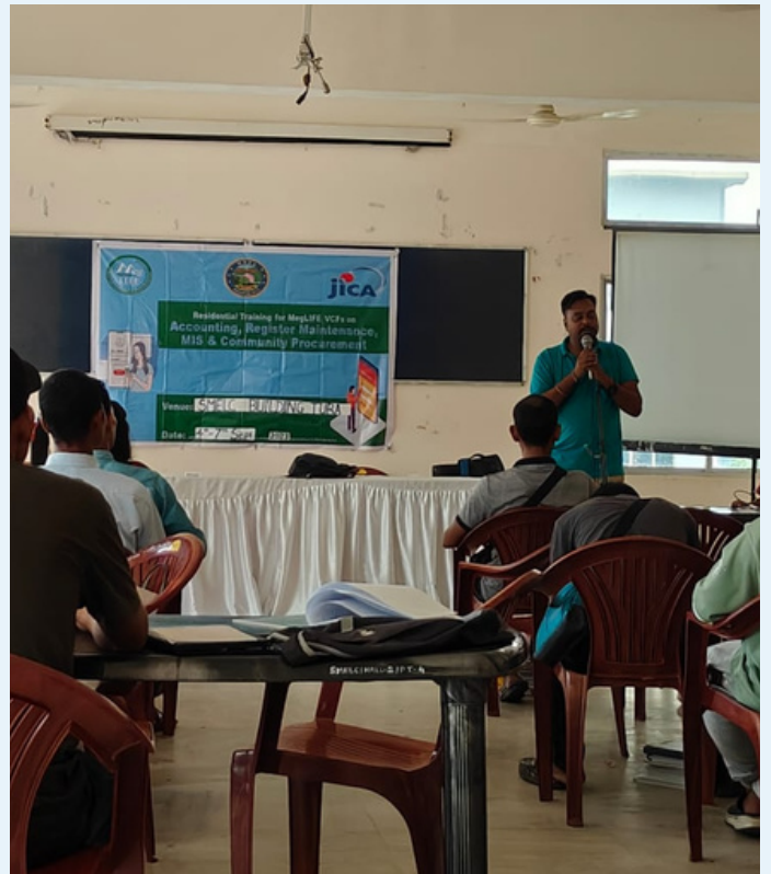
South west Garo Hills