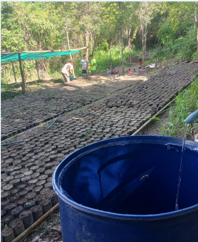
Nursery extension at Tlangpui village.