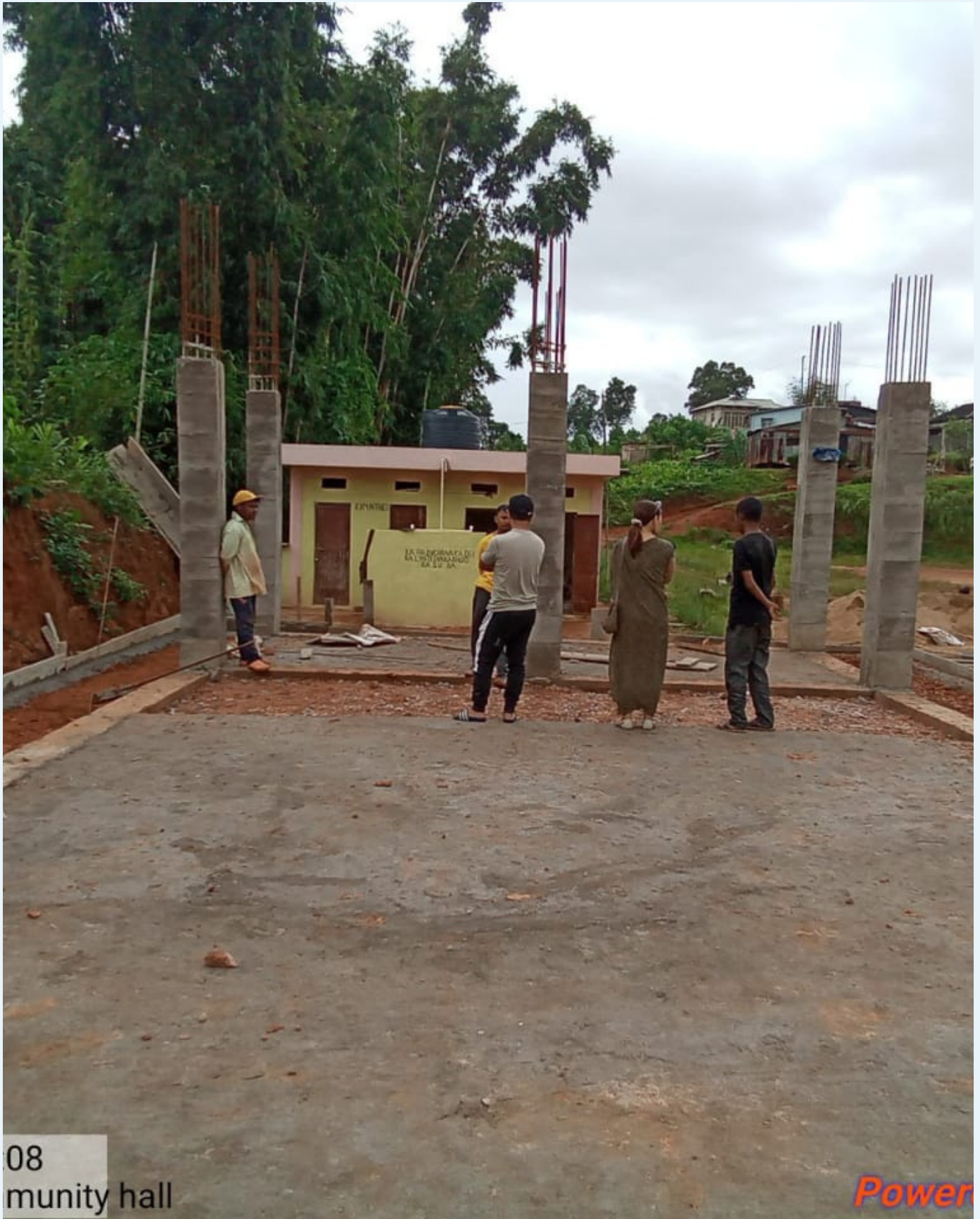
08 community hall