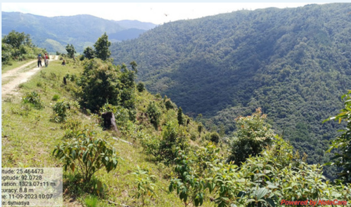
PES verification at Syniasya village.