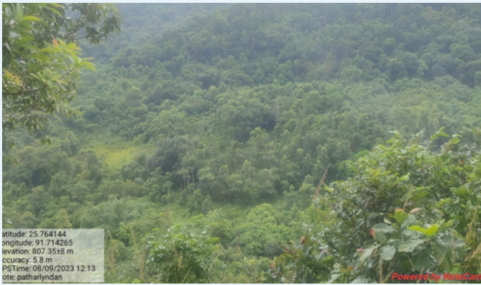
PES verification at Patharlyndan village.