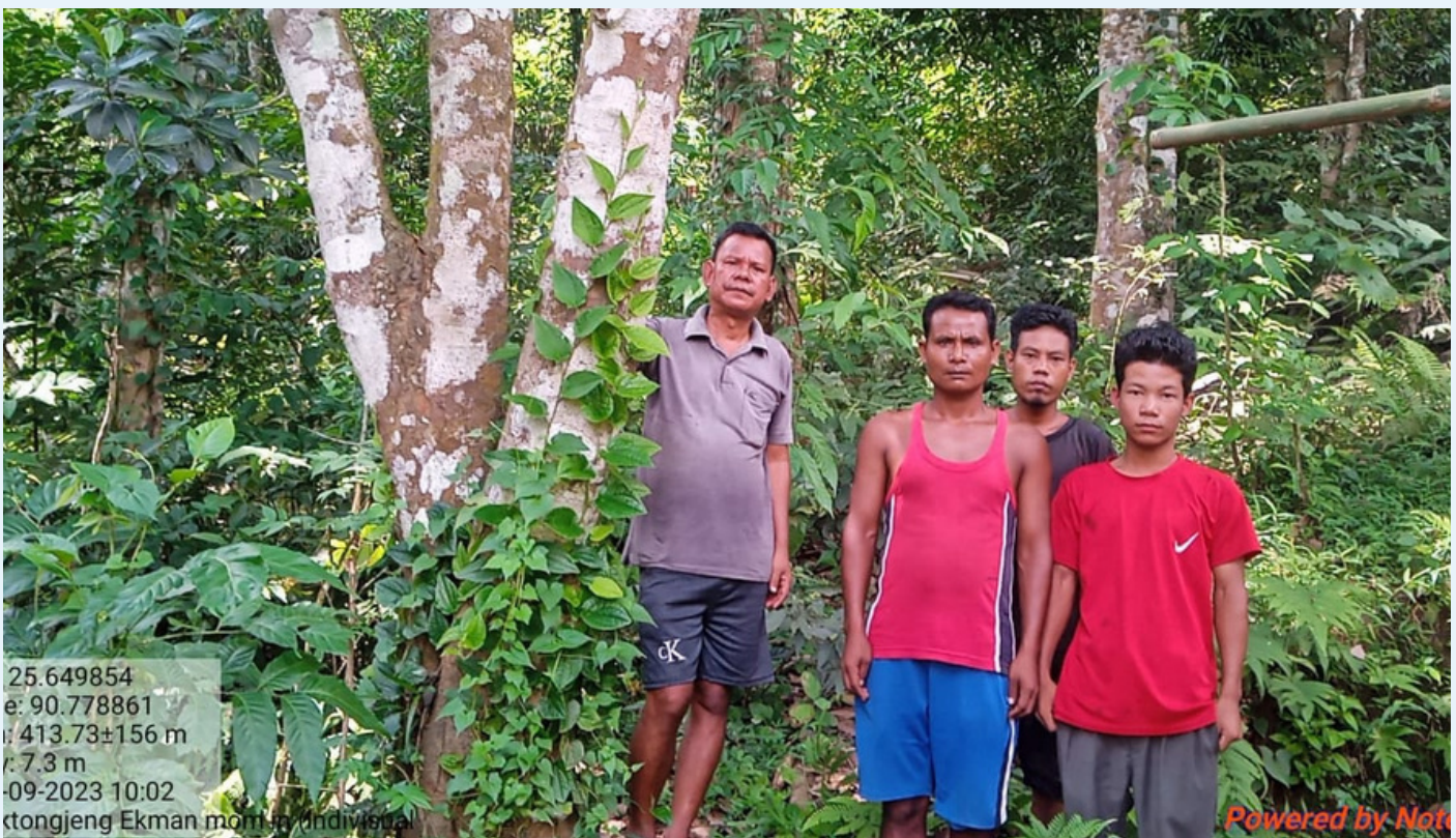
PES verification completed in Mikotongjeng village.