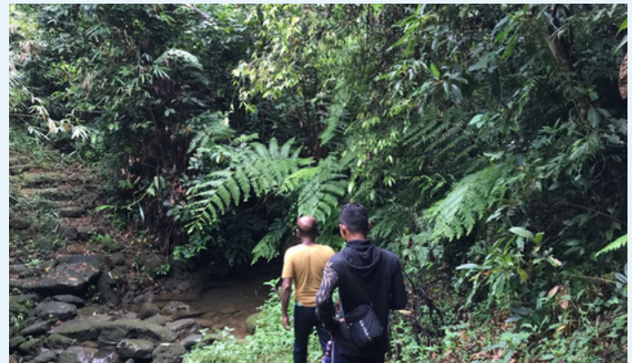
PES verification at Lamin village.