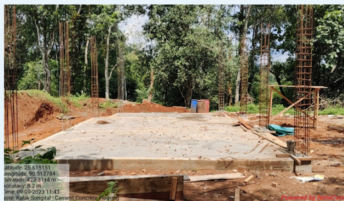
Kalak Songital village.