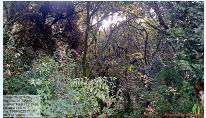
PES verification at Lairyngew village.