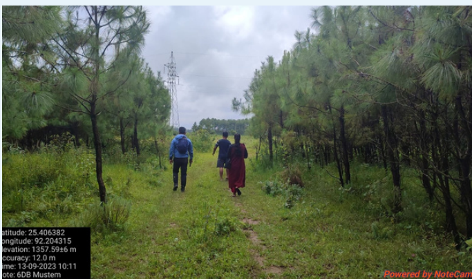
PES verification at Mustem village.