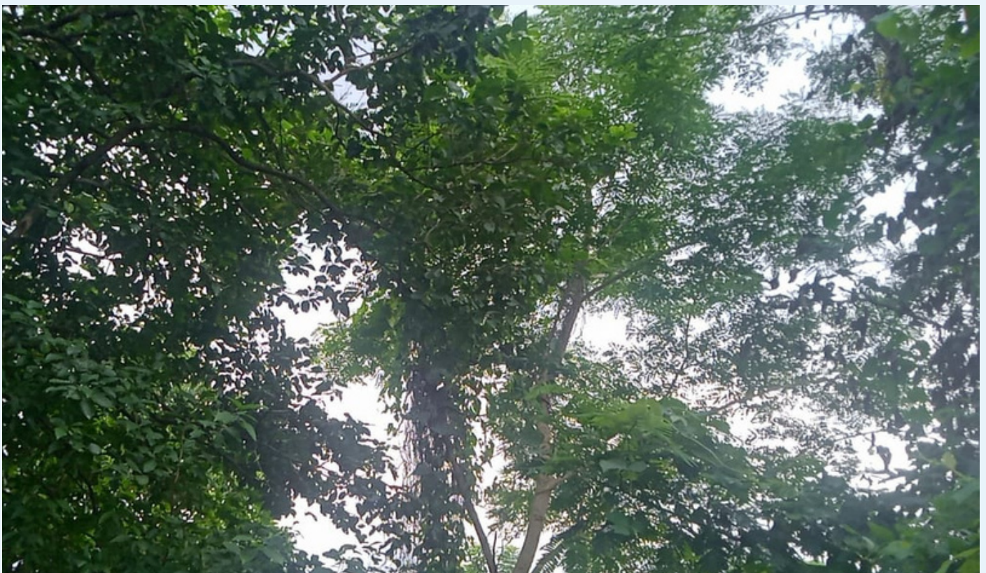
PES verification at Songsak Agalgre village.