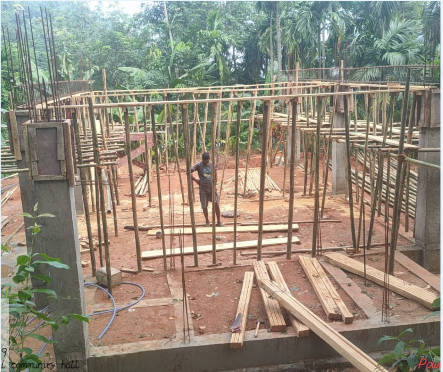
Rajasimla Songgital village.