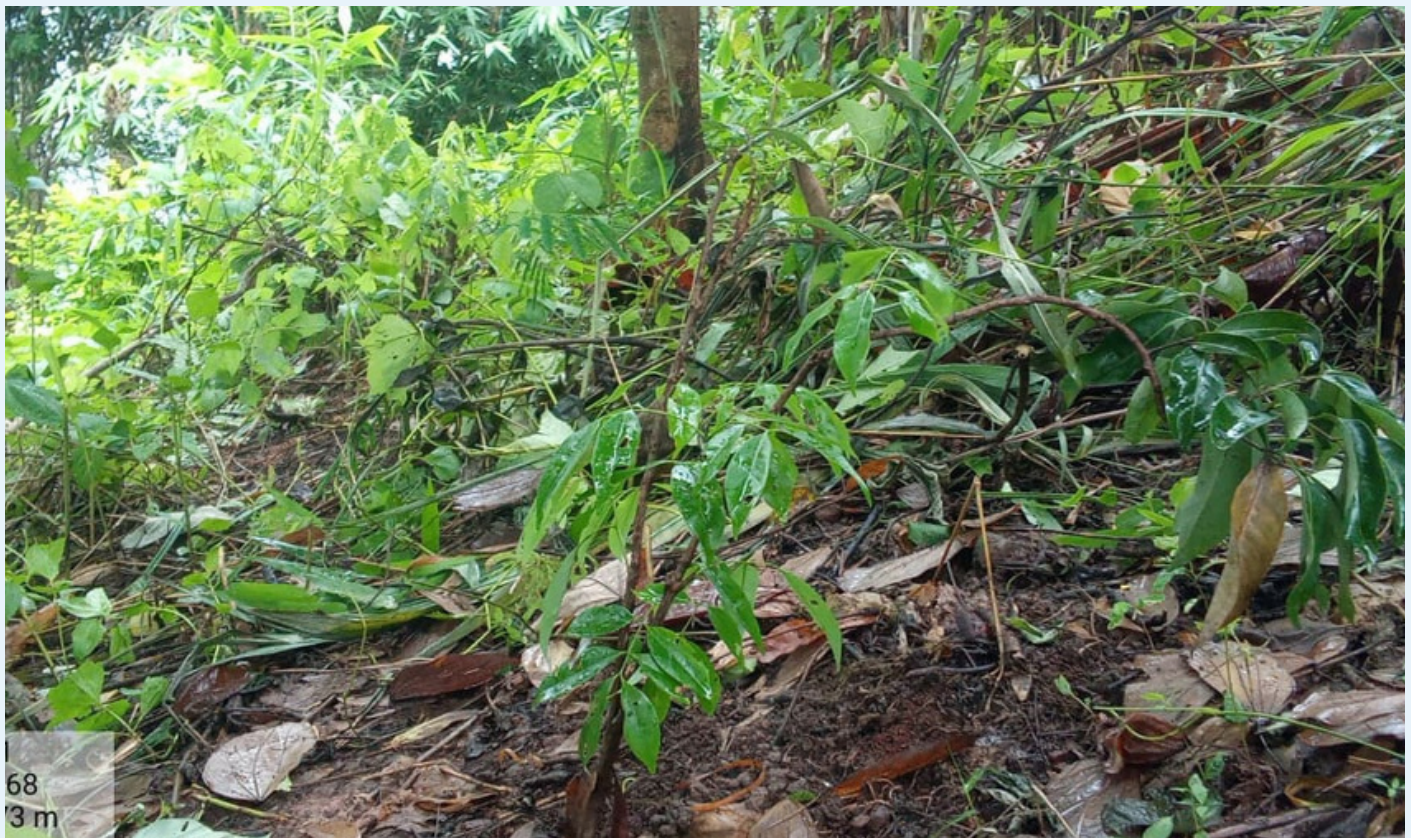
Mejolgri Nokat village.