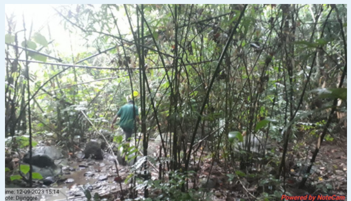
PES verification at Dijingre village.