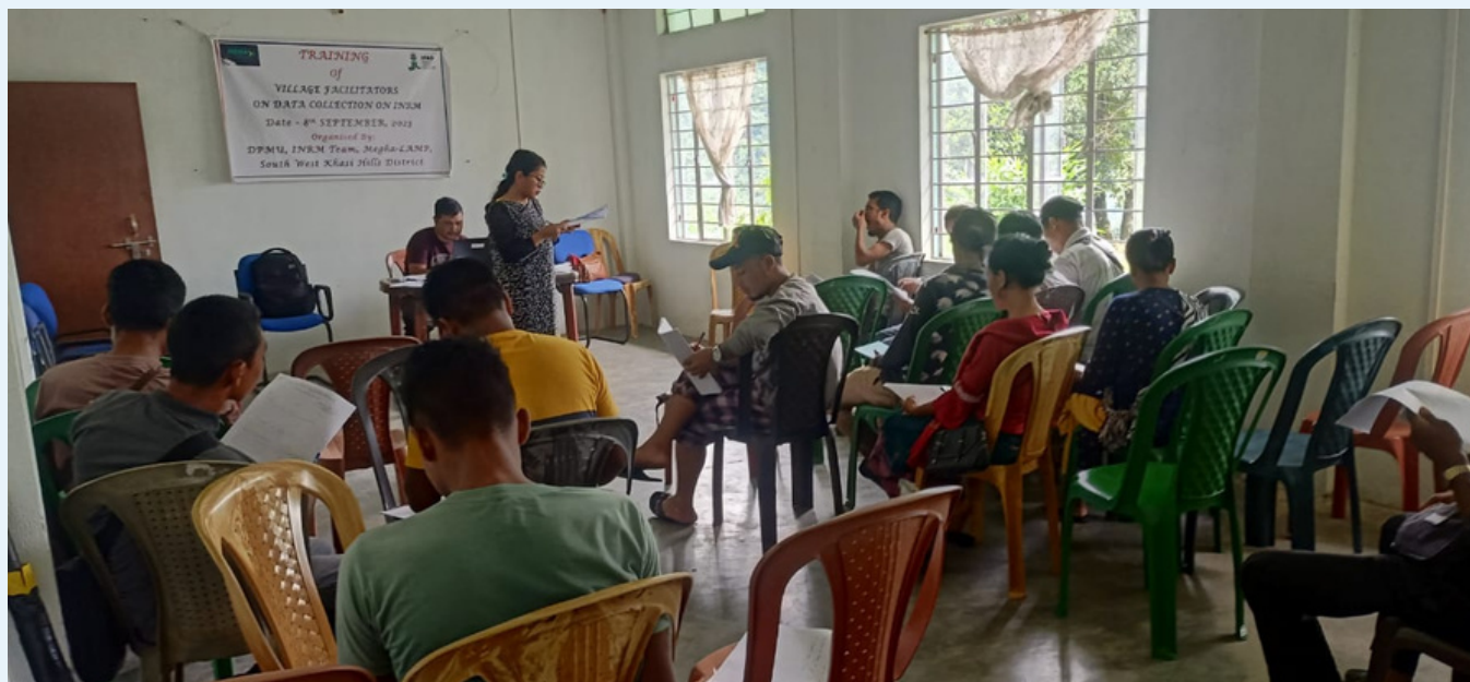
Training session for Village Facilitators on INRM data collection was conducted on September 8, 2023, in Ranikor, South West Khasi Hills.