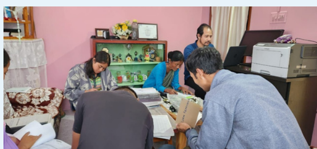
8th September 2023: Preparation of Audit Statements of Mawthwan IVCS Ltd.

Several Special General Meetings (SGMs) were held recently in different locations. On September 6, 2023, Nonglatem IVCS in Thadlaskein Block, West Jaintia Hills conducted an SGM to discuss amending new by-laws. Another SGM took place on September 9, 2023, at Mawbeh, with all IVCS members in attendance. On September 11, 2023, Mawlumrum Nangkyntiew IVCS Ltd. held an SGM in Mawlumrum village, focusing on by-law amendments and attended by IVCS members, the Managing Committee, and EFC staff, East Khasi Hills. Lastly, an SGM for comprehensive by-law amendment, following PACS guidelines, was conducted on September 12, 2023, in Jatah, Mawkyntiew C&RD Block, East Khasi Hills .