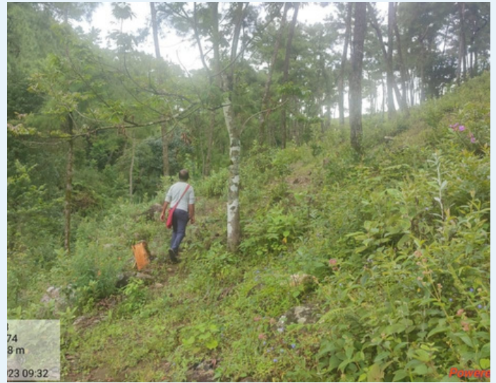
PES verification at Mawtharap village.