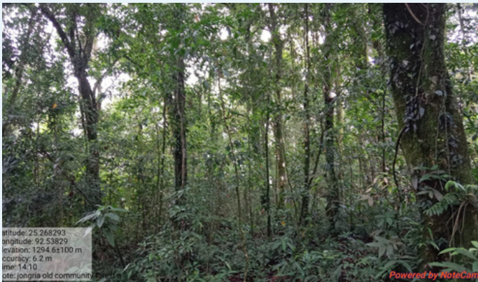
PES verification at Old Jongria village.