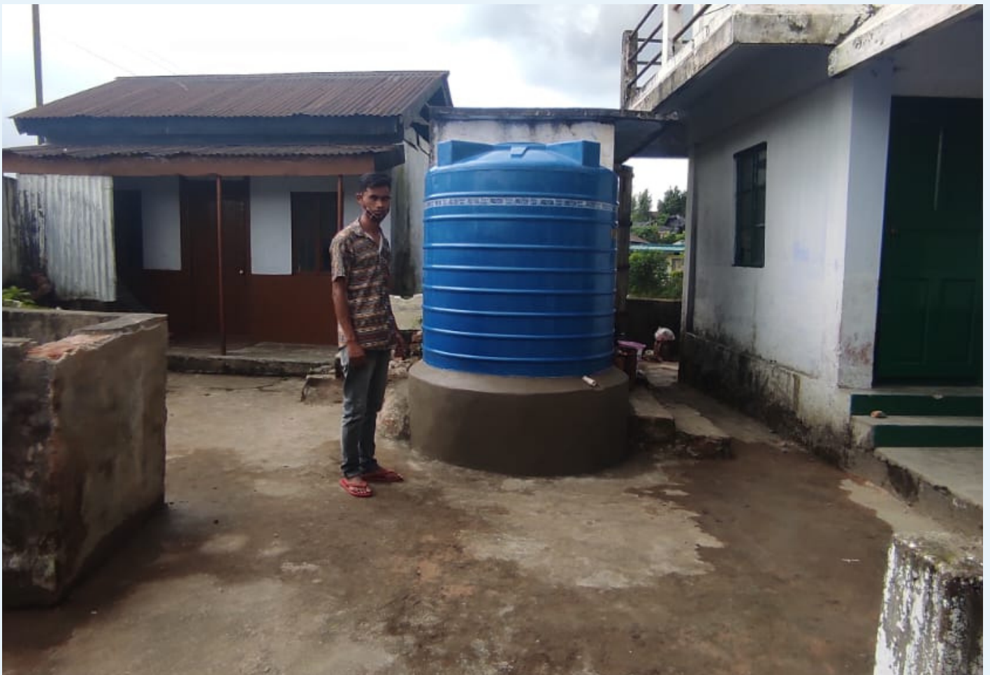
Plastic tanks at Pynthorlangtein village, under Thadlaskein Block.