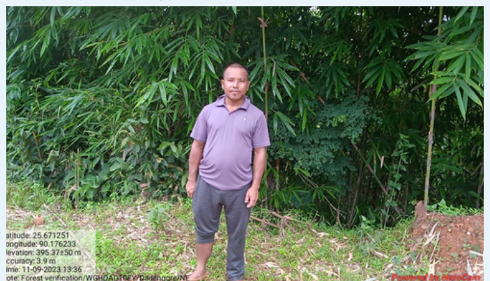
PES verification completed by Dadengre Block applicant.